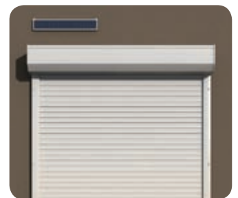
Solar Panel to Wall