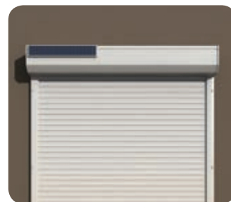
Solar Panel to Pelmet

The SolarSmart™ solar panels are an aluminium framed amorphous type which have excellent power output even in cloudy conditions, but must be directly exposed to sunlight in normal sunny conditions. They also have a better power output than most solar panels when affected by heat. North, east and west facing orientations require 1 solar panel. South facing orientations require 2 solar panels for optimum performance. The solar panels are supplied with 2 brackets which allow the panels to be attached flat to the pelmet or wall, or to the required angle to ensure maximum power performance. With all solar panel installations, all wires must be protected from UV radiation and the weather with all drill holes well sealed.