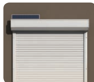
Angled Solar Panel